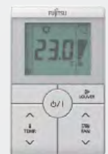
Simple Wired Controller (without Operation mode)* UTY-RHRYT

*Optional Communication Kit required for connection