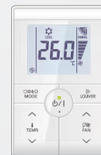
Simple Wired Controller* UTY-RSRYT