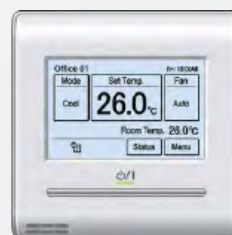
Wired Touch Controller* UTY-RNRYTS